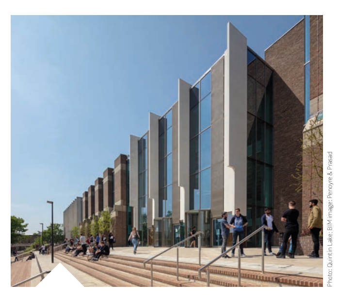
Above and left: The refurbishment and extension of the Templeman Library at the University of Kent by Penoyre & Prasad has a concrete frame and a distinctive facade made up of precast concrete projecting fins. The project team's shared use of data via collaborative BIM software made it possible for the precast contractor to develop the fins concurrently with the structural model (left), contributing to a successful outcome

cementitious materials, the original definition needed to be modified to ensure that only materials beneficial to improving sustainability performance were included. This led to a step reduction in the apparent value but the original 2020 target value of 35% has been retained.